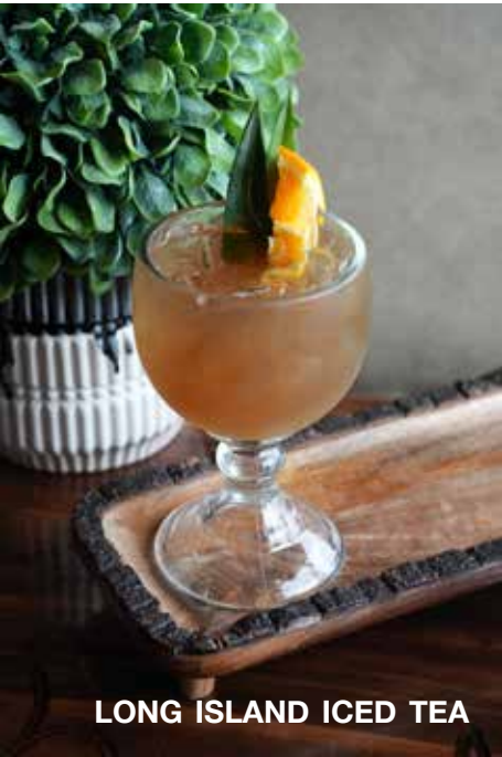
LONG ISLAND ICED TEA