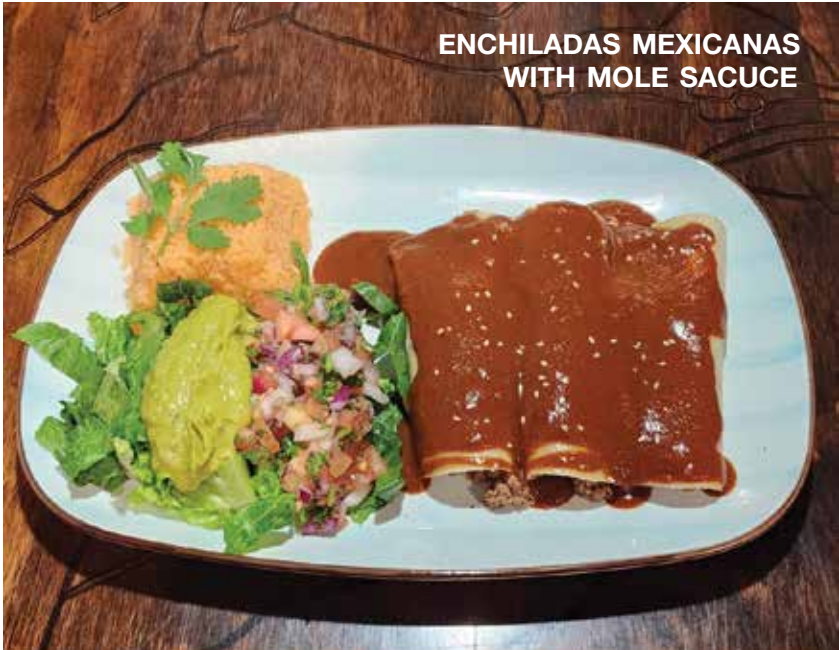
ENCHILADAS MEXICANAS WITH MOLE SASURE