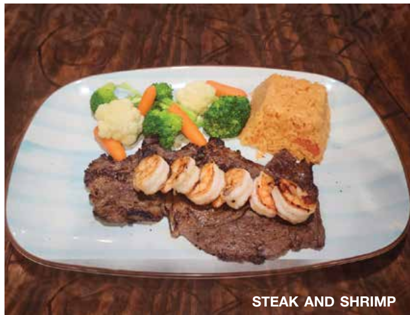
STEAK AND SHRIMP