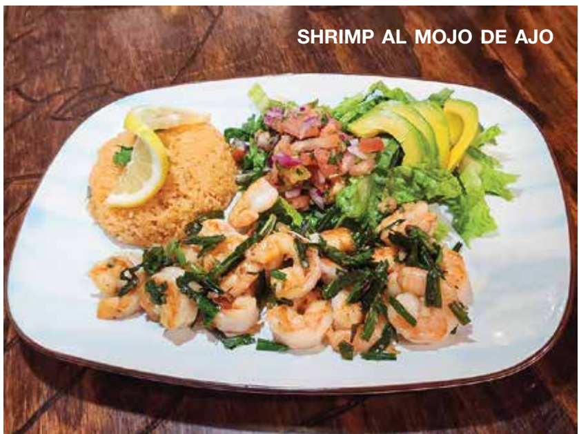
SHRIMP AL MOJO DE AJO