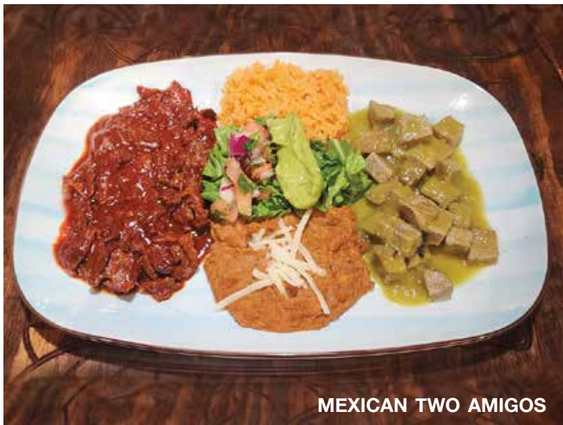
MEXICAN TWO AMIGOS