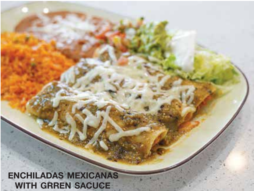
ENCHILADAS MEXICANAS WITH GRREN SACUCE