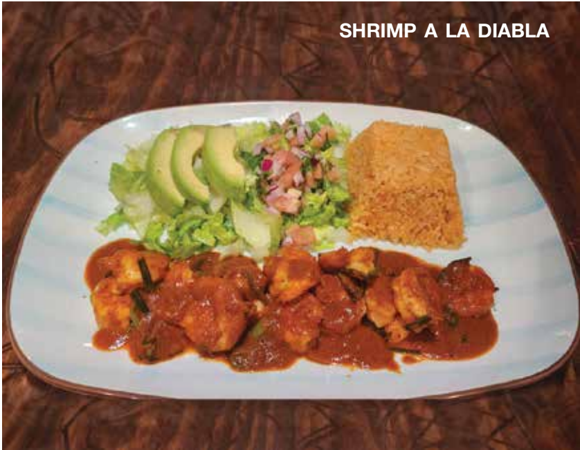
SHRIMP A LA DIABLA